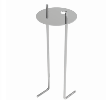
Accento anchor bolts