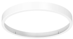
Kost accessories 350mm