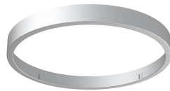
Kost accessories 350mm