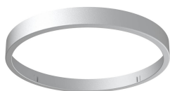
Kost accessories 300mm